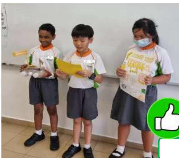
Our Frontiers presenting their poster and boat