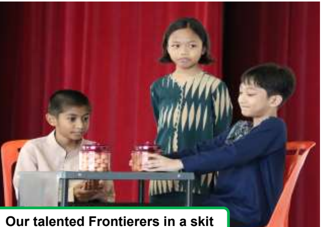
Our talented Frontierers in a skit