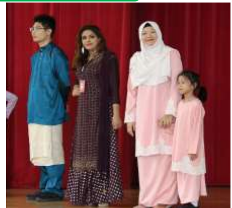
Our Frontierers in a fashion parade, song and dance performances