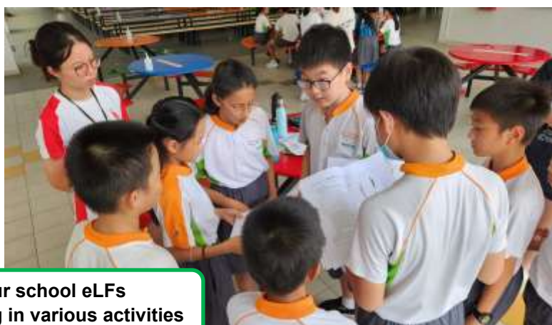
Our school eLFs engaging in various activities