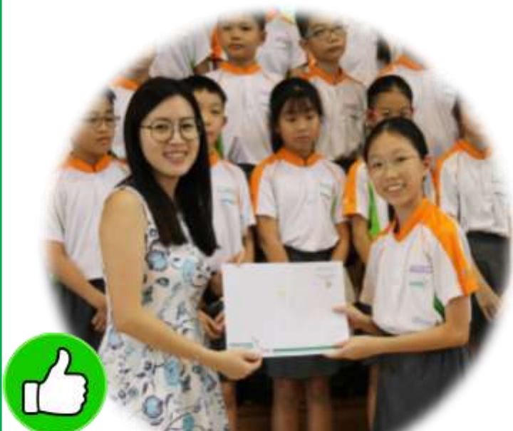
Chairperson for 8th School eLF Council receiving her letter of appointment

On Monday, 17 April 2023, Frontier Primary School held its annual School eLF Investiture Ceremony to mark the formal induction of 118 School eLFs as well as the handover of leadership from the 7th School eLF Council to the 8th School eLF Council.