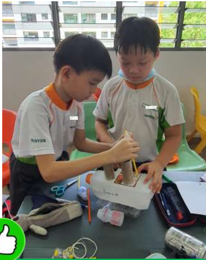
Our Frontiersers designing and testing out their boat prototype